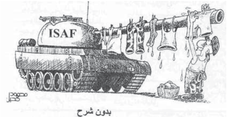
Cartoon from Tulu-e Afghanistan 14 April 2004. "No comment", reads the caption

Narcotics. In 2003, Afghanistan produced an estimated 3,600 metric tons of opium, its second largest opium harvest after 1999. The harvest, with an estimated value of $35 billion, accounted for more than three-quarters of the world's opium supply. This marked a sharp rebound from the near eradication of poppy production during the last year of Taliban rule in 2001, when Afghanistan is believed to have produced less than 5% of this amount. A further production increase of 30% is projected by some sources this year. Poppy is now present in 28 out of the 32 provinces, expanding to areas with no history of previous involvement. Approximately 7% of the Afghan population is thought to economically benefit from poppies in some